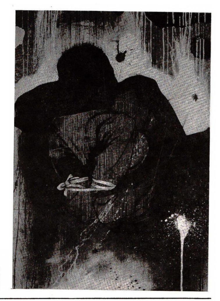
"When Human Treat a Human" Bayu Utomo Radjikin Charcoal on Paper 123 x 93 cm Malaysia

The other assumption, that the GNB Exhibition was forcing a "fantasy" concept, made no sense: exhibiting developing nations in the world of international visual art. This is based on a very pessimistic attitude. When the concept for the GNB exhibition was first proposed by the Director General of Culture, Dr Edi Sedyawati, in a meeting with visual art representatives in April 1993, this pessimistic attitude was already apparent. It was proposed then, in commentary, that the plan could not succeed, because of the reality that Indonesia was not on the international visual art map. This perspective of course did not recognise the changes that are taking place in the world of international visual art (because of a lack of information), that are in fact opening up opportunities for the